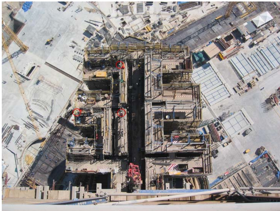
Figure 3: GPS active control points

To remove that restriction it will be necessary to consider this instrument as a local 3D axis system. The coordinates computed by using the observations (directions and distance) are internally consistent but must be transformed into the reference frame defined by the set of GPS antennas. In our case as we use a single total station, the problem is simply a 3D transformation also known as similarity transformation or Helmert transformation.