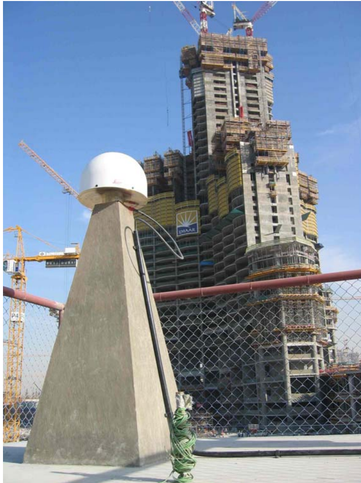
Figure 2: Continuous Operating Reference Station

After completion of observations, data is returned to the office for processing. Computation of GPS antenna positions is carried out, processed against data from a Continuously Operating GPS Reference Station Leica GPS GRX1200 Pro with AT504 choking antenna and Leica GPS Spider software, using Leica Geo Office software (LGO).