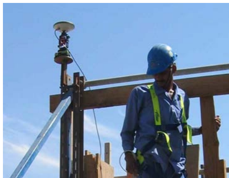
Figure 1: GPS and circular prism collocated

A tiltable circular prism is placed below each antenna and a Total Station instrument (TPS) is set up on the concrete visible to all GPS stations. The GPS plus TPS comprises a “measurement system”.