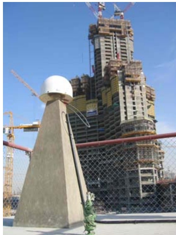
Figure 2: Continuous Operating Reference Station

After completion of observations, data is returned to the office for processing. Computation of GPS antenna positions is carried out, processed against data from a Continuously Operating GPS Reference Station Leica GRX1200 Pro with AT504 chokering antenna and Leica GPS Spider software, using Leica Geo Office software (LGO).