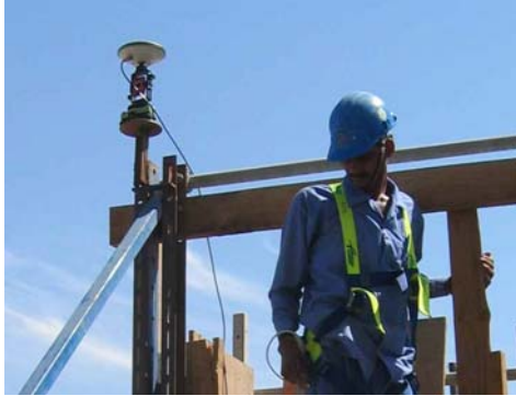
Figure 1: GPS and circular prism collocated

A circular prism is placed below each antenna and a Total Station instrument (TPS) is set up on the concrete visible to all GPS stations. The GPS plus TPS comprises a “measurement system”.